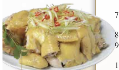
薑蔥霸王走地雞 (微辣) Ginger & Green Onion Sauce Free Run Chicken (Mild Spicy)