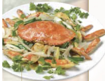
BC大肉蟹 BC Fresh Crab