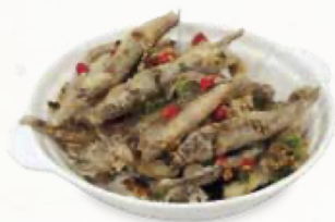
椒鹽多春魚 Capelin Fish with Chilly Salt $12.00