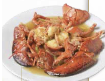
東岸大龍蝦 Fresh Lobster