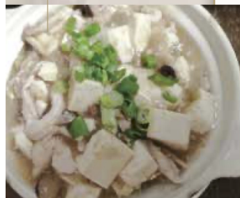
咸魚雞粒豆腐煲 Preserved Fish with Diced Chicken & Tofu Hot Pot