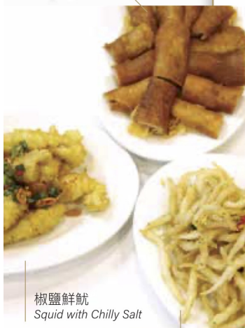
椒鹽鮮魷 Squid with Chilly Salt