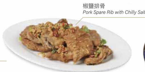
椒鹽排骨 Pork Spare Rib with Chilly Salt