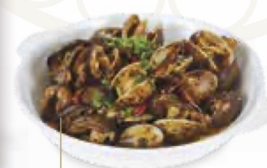
豉汁炒蜆 Stir Fried Clams in Black Bean Sauce