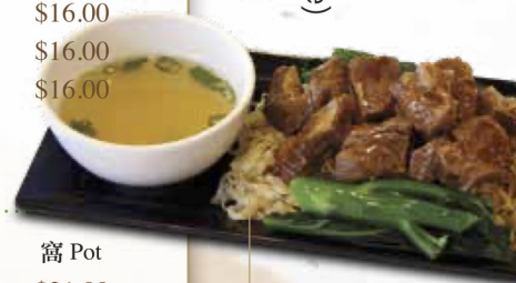
牛腩撈麵 Beef Brisket Dry Noodle

[雙拼加$2.00 Additional $2.00 for Any Two Combination]