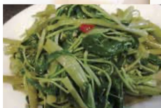
蒜蓉炒通菜(時令) Stir Fried Ong Choy with Garlic (Seasonal)