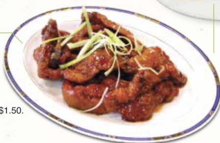
京都汁豬扒 Deep Fried Pork Chop with Sweet Sour Sauce