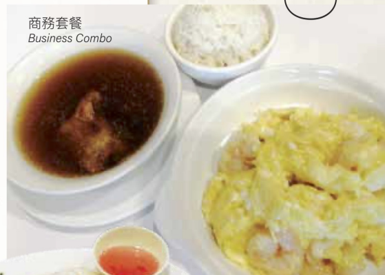
商務套餐 Business Combo

Change to Salt Baked Free Range Chicken, Ginger & Green Onion Sauce Free Run Chicken, or Free Range Duck + $5.00