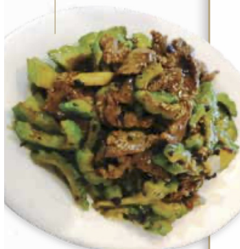
涼瓜炒牛肉 Stir Fried Beef with Bitter Melon