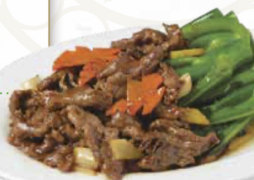
芥蘭牛肉 Stir Fried Beef with Chinese Broccoli