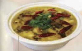
農家酸菜魚 Fish with Pickled Vegetable