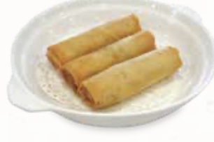
素菜或鮮蝦春卷 Deep Fried Vegetable or Shrimp Spring Roll $8.00