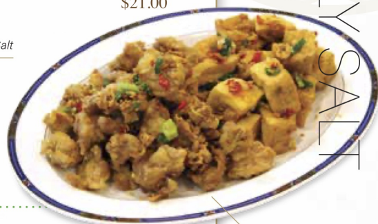
椒鹽豆腐拼雞膝 Bean Curd & Chicken Knee with Chilly Salt