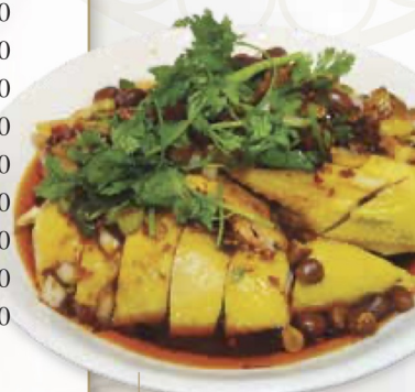
農場口水雞 House Special Chicken with Spicy Sauce