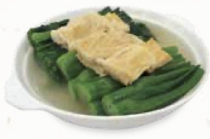
上湯腐皮浸菜心 Vegetable with Bean Curd in Chicken Broth $12.00