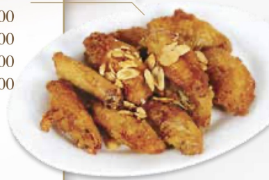
風沙雞翼 Deep Fried Spicy Chicken Wing