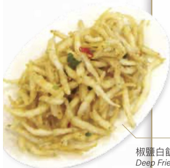
椒鹽白飯魚 Deep Fried Silver Fish with Chili Sauce