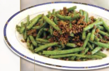
干扁四季豆 Dry Shrimp & Ground Pork w/ Spicy Green Bean