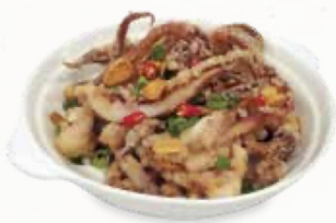
蒜香魷魚鬚 Deep Fried Squid Tentacle with Fried Garlic $12.00