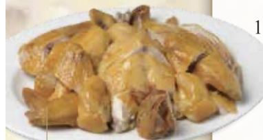
招牌豉油皇走地雞 Signature Soy Sauce Free Range Chicken