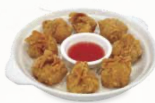
酥炸雲吞 Deep Fried Wonton (8pcs) $12.00