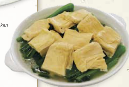
上湯腐皮浸菜心 Seasonal Vegetables With Bean Curb Skin in Soup