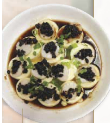
豉汁帶子蒸玉子豆腐 Steamed Scallops with Egg Tofu in Black Bean Sauce