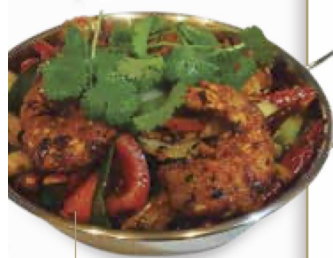
干鍋老虎蝦 Stir Fried Tiger Prawn in Pot