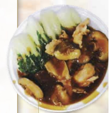
北菇雞球飯 Chicken with Chinese Mushroom on Rice

任何折扣並不適用於每項十九元或以下的菜單。所有價格如有更改，恕不另行通知。 Discount not applicable to items of $19.00 or less. Prices subject to change without notice