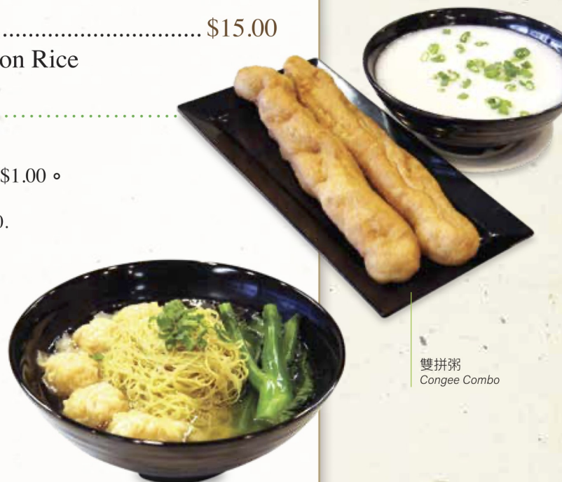
雙拼粥 Congee Combo