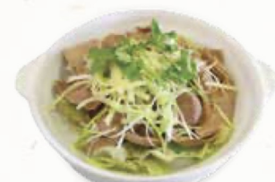
白灼腰腩 Plain Pork Kidney and Liver $15.00