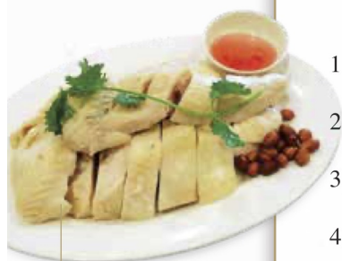
金牌貴妃走地雞 Empress Free Range Chicken