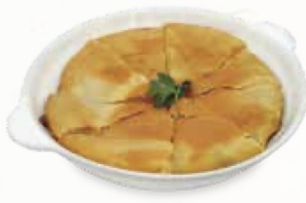
蔥油餅 Chinese Green Onion Pancake $8.00