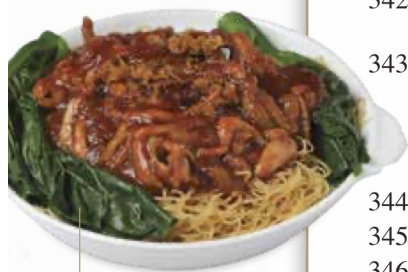
X.O.炸醬撈麵 Minced Pork with X.O. Sauce Dry Noodle