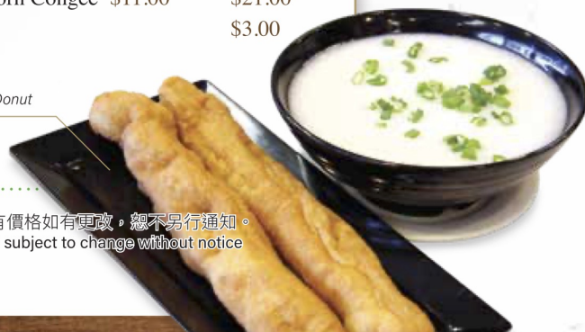
各式粥品及炸油條 Congee and Chinese Donut

任何折扣並不適用於每項十九元或以下的菜單。所有價格如有更改，恕不另行通知。 Discount not applicable to items of $19.00 or less. Prices subject to change without notice