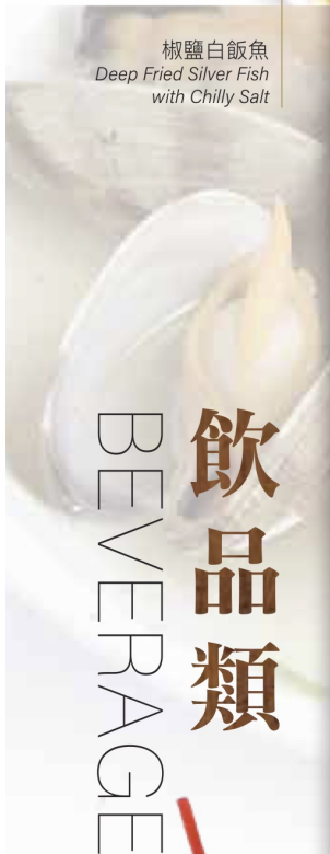
椒鹽白飯魚 Deep Fried Silver Fish with Chilly Salt