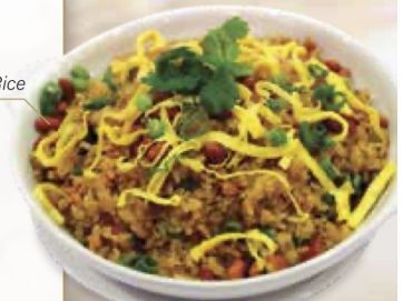
生炒糯米飯 Pan Fried Sticky Rice

Rice Change to Chow Mein, Rice Noodle, Vermicelli add $3.00