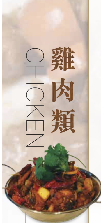
川味辣子雞 Spicy Diced Chicken in Szechuan Style