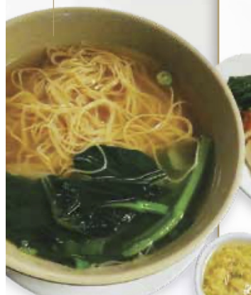
走地雞湯麵 Free Range Chicken Noodle