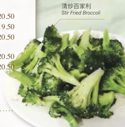
清炒百家利 Stir Fried Broccoli