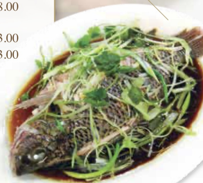
清蒸游水鯽魚 Steamed Tilapia