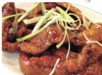
京都肉排 Peking Style Pork Chop