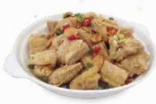
蒜香腐皮球 Deep Fried Bean Curb Skin with Fried Garlic $12.00