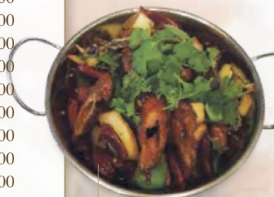
干鍋大腸 Stir Fried Pork Intestine in Pot