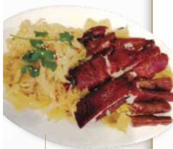
海哲拼酥炸大腸 Deep Fried Pork Intestine & Jelly Fish