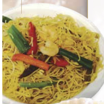
星洲炒米粉 Singapore Style Fried Rice Vermicelli