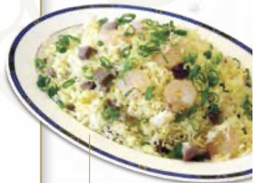
楊州炒飯 Yang Chow Fried Rice