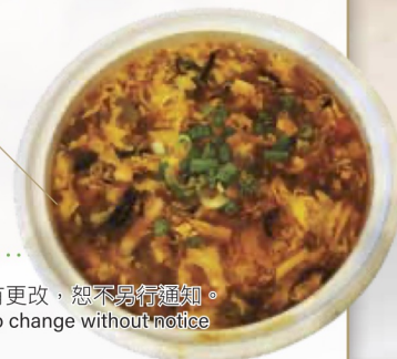
酸辣湯 Hot & Sour Soup (Thick)