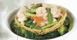
脆麵龍鳳球 Prawn & Chicken with Crispy Basket