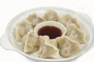
農場雞肉餃 Chicken Dumpling (8pcs) $12.00