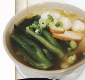
魚蛋炸魚片湯麵 Fish Ball Noodle in Soup