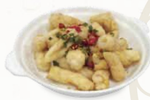
椒鹽鮮魷 Squid with Chilly Salt $12.00