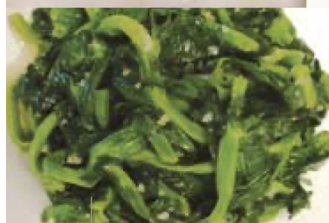
蒜蓉炒豆苗 Stir Fried Pea Tips with Garlic