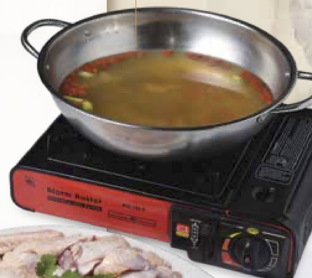
杞子花雕雞 Free Range Chicken with Wolfberry Wine Sauce

任何折扣並不適用於每項十九元或以下的菜單。所有價格如有更改，恕不另行通知。 Discount not applicable to items of $19.00 or less. Prices subject to change without notice. 白飯改油飯加$1.00，姜茸$1.00/碟。 Plain Rice Changed to Chicken Oil Rice Add $1.00. Ginger Sauce $1.00/Dish.