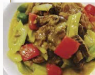
咖喱牛筋腩 Curry Beef Brisket and Tendon