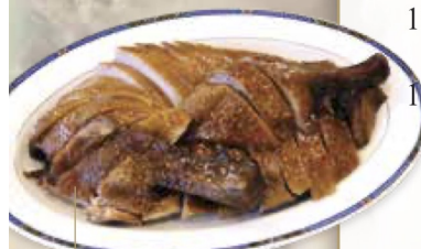
豉油皇走地鴨 Soy Sauce Free Range Duck