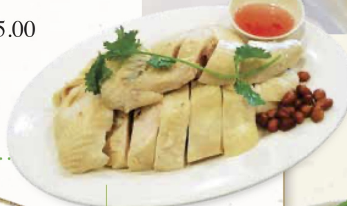
農場走地雞 Free Range Chicken