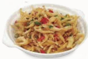
椒鹽白飯魚 Silver Fish with Chilly Salt $12.00