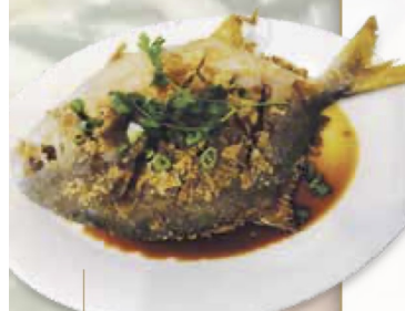
美極煎鰱魚 Pan Fried Pomfret in Maggi Sauce