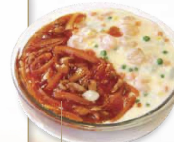
鴛鴦炒飯 Honey Moon Fried Rice