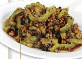
欖菜肉碎炒涼瓜 Stir Fried Bitten Melon w/ Minced Pork