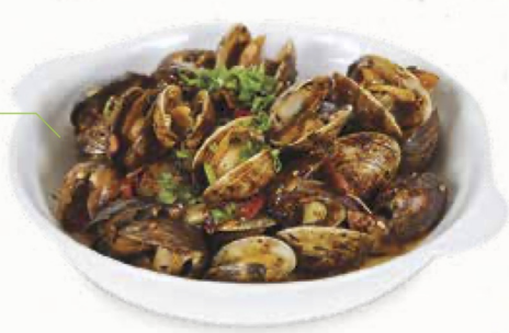
豉汁炒大蜆 Stir Fried Clam with Black Bean Sauce $15.00